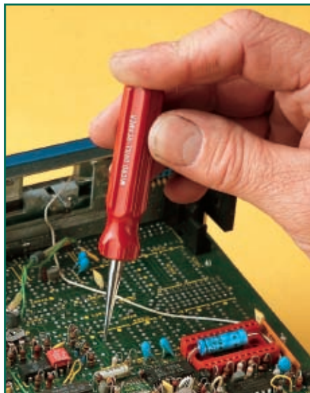
MICRO DRILL REAMERS